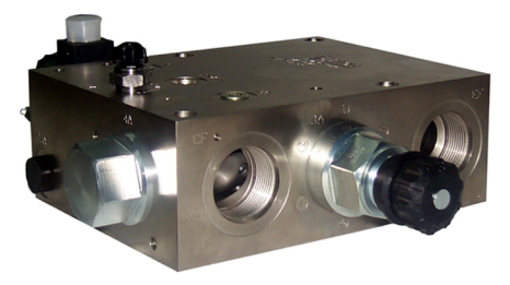
HVD - 1130 Single Pump - 130 GPM/pump