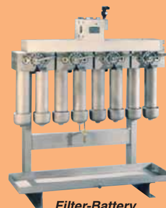
Filter-Battery BEHD 4 x 901